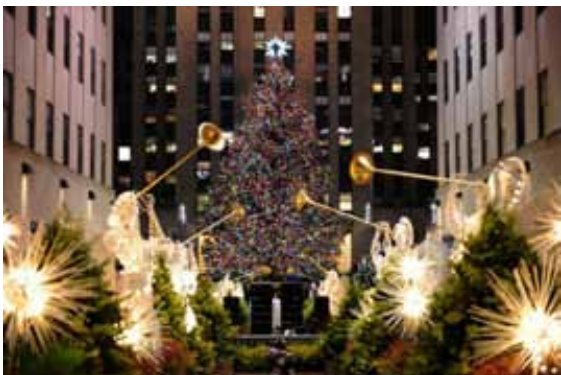
HOLIDAY WALKING TOUR OF NYC!

Thanks to all the hearty MCSC members who made their way by car and train into the heart of New York City on a PEAK holiday season