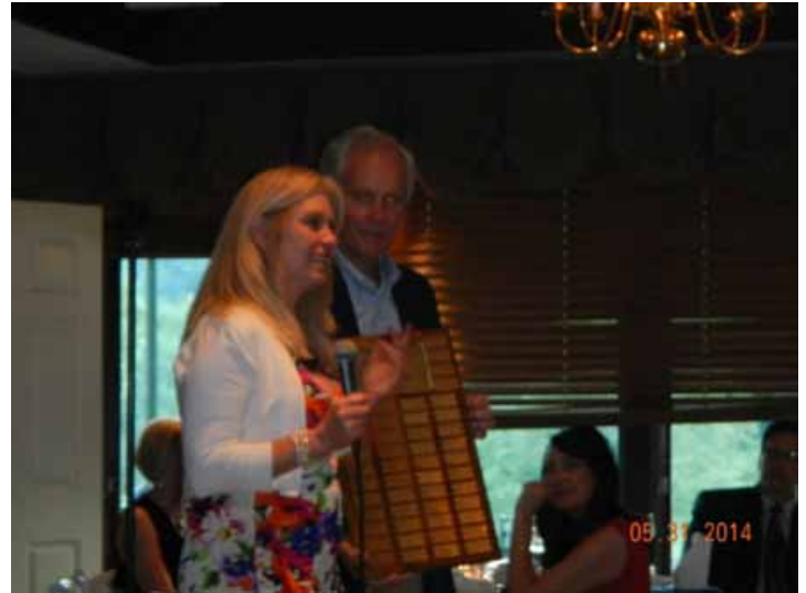
And the "Outstanding Member of the Year"