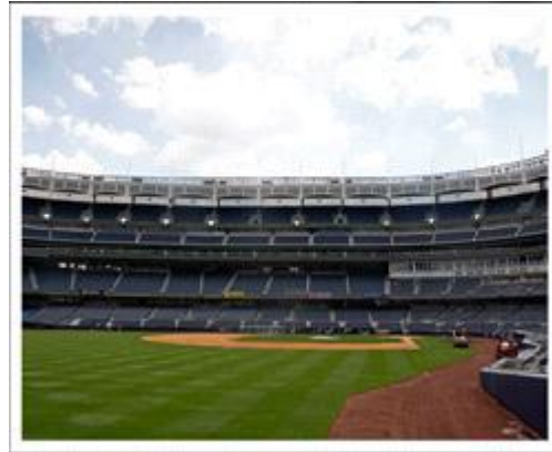
Actual View From Our Seats!