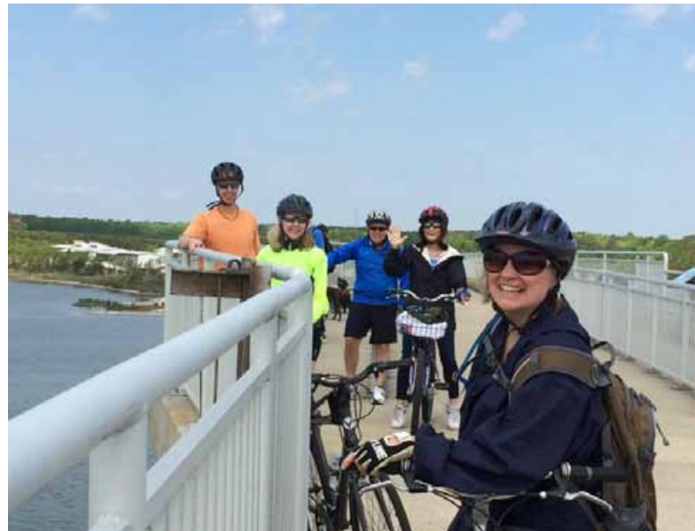
Clarion Resort Fontainebleau Hotel

What a great weekend at Ocean City MD. We shared the town with the Cruisin OC, a custom classic muscle car show. Their website describes the event as "thousands of classic cars, Hot Rods, and tricked out trucks flood the streets for the annual Cruisin' Ocean City car show weekend." This basically turns into a car parade the whole weekend, a nice bonus.