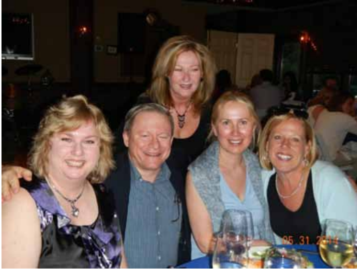
The Photographer and The Ladies

Morris County Ski Club Newsletter June 2014