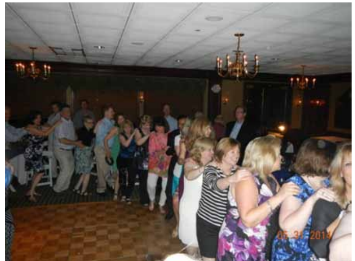
Dancing with the Stars