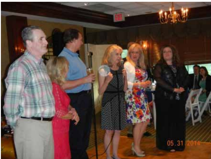
The MCSC BOARD