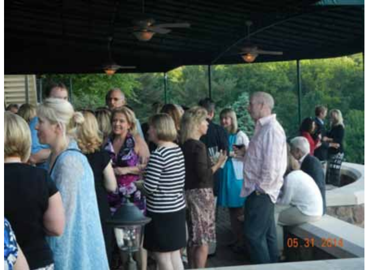
Beautiful People and Beautiful View